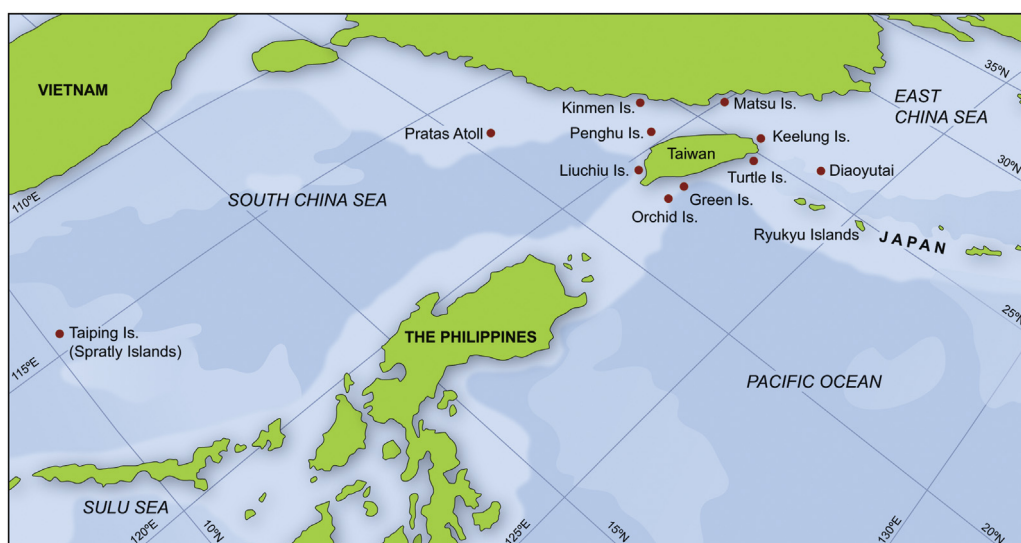
Map 1. A different map of Taiwan, sensitive to its de facto archipelagic character.

Since the 1990s, there is growing evidence in Taiwan of confrontation, competition and negotiation of visions and representations of the future by local interests, even if this appears to be primarily a movement that blocks initiatives (rather than one that proposes them). Two episodes that relate to the offshore islands stand out in recent Taiwanese history as exemplary of such blocking manoeuvres: the disposal of nuclear waste on Orchid Island/Pongso