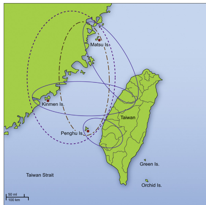
Map 2. A visualization of island-to-island relations amongst Taiwan's islands.

What about the analysis of these same multiplicities in the context of the nature of the polity of Taiwan as de facto archipelago? It is the geo-physically fragmented and unequally distributed